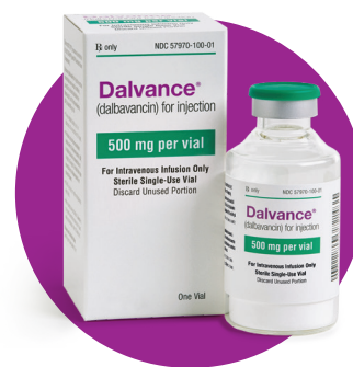
Vial shown not actual size.