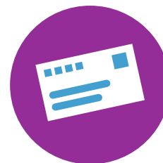
Most commercial health insurance plans

*Outpatient intravenous treatment can be administered in EDs/observation units, hospital outpatient departments (HOPDs), freestanding infusion centers, physician offices, and hospital-affiliated infusion centers. 2