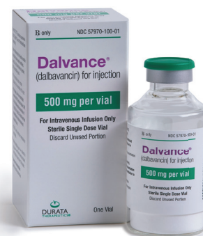
Vial shown not actual size.

Please see reverse side for additional Important Risk Information. Please see accompanying Product Information or visit https://www.rxabbvie.com/pdf/dalvance_pi.pdf